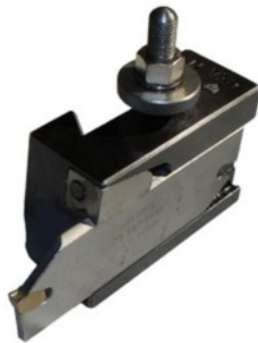
Parting Tool .200 Insert