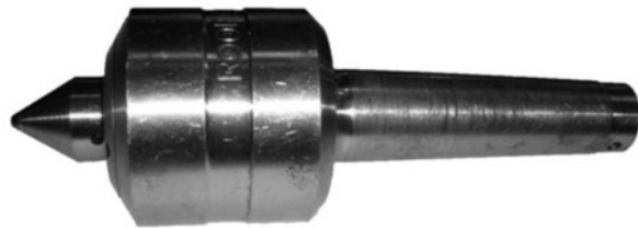
Center Drill, Lathe