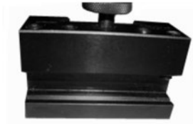
80° Lathe Cutting Tool