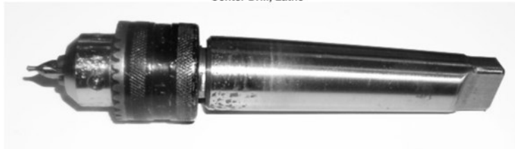
Drill Bit in a Lathe Chuck